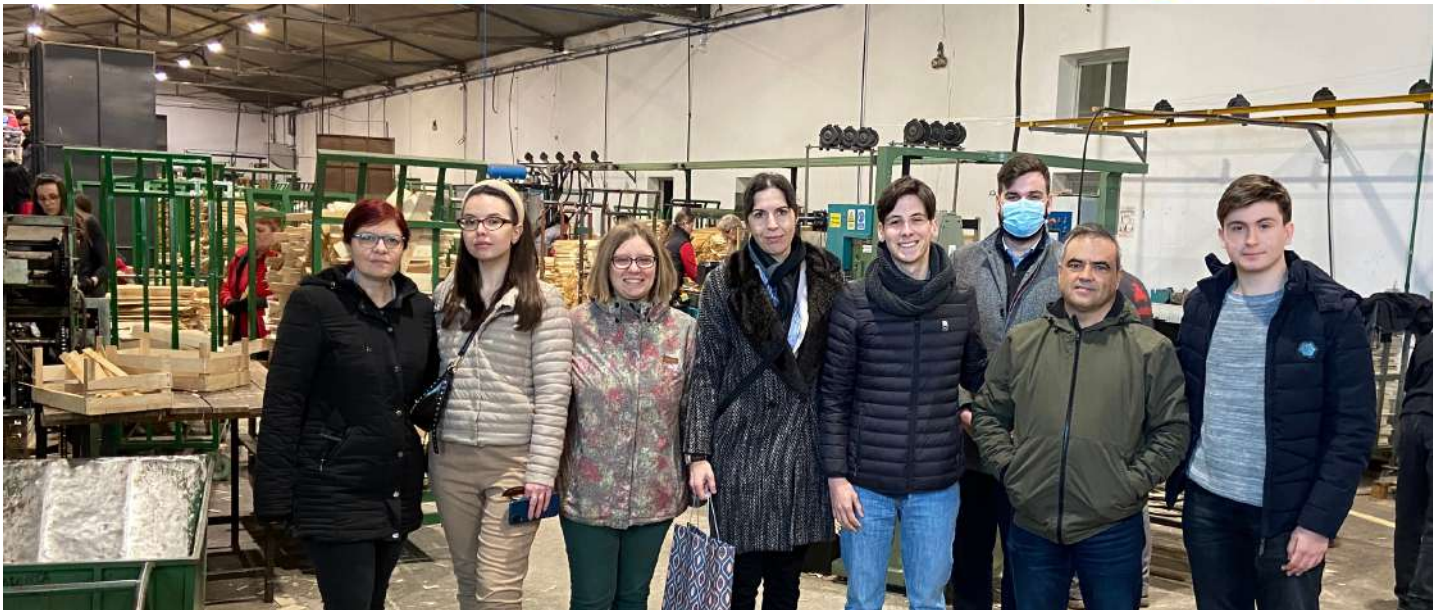
Members of the project management on an official visit at Ambalazerka d.o.o ,production plant